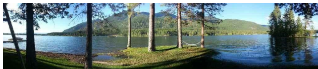
Lake Blaine panoramic.

Fish distribution records indicate a presence of brook trout, kokanee, lake trout, largemouth bass, largescale sucker, longnose sucker, northern pike, northern pike minnow, rainbow trout, sunfish, westslope cutthroat trout, and yellow perch. For more information see: https://fwp.mt.gov/fish/stocking.html