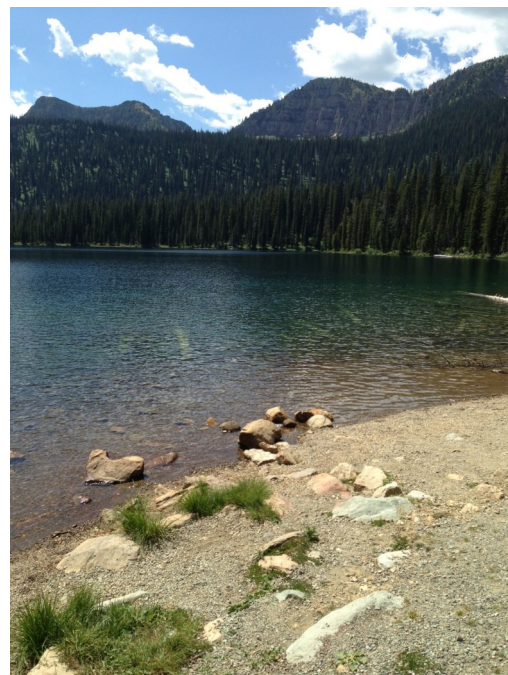
The primitive boat launch at Big Therriault.