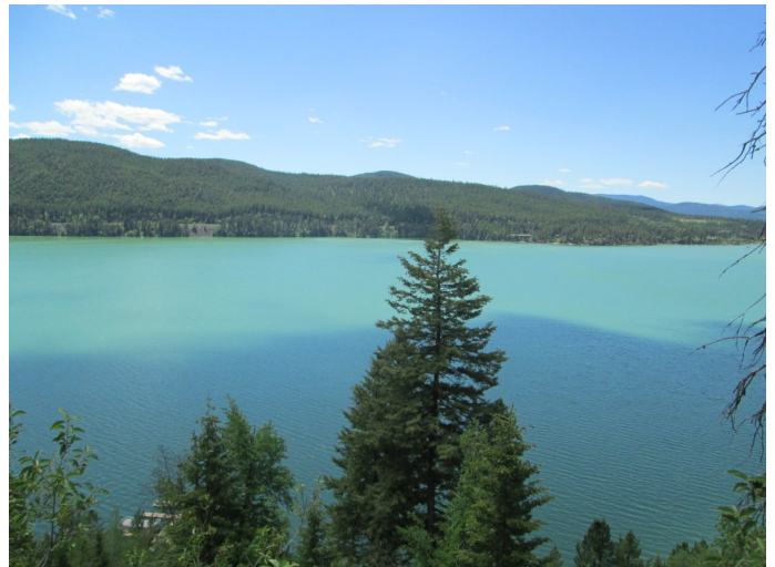
Whitefish Lake with nutrient plume resulting from late spring runoff from Swift and Lazy Creeks.