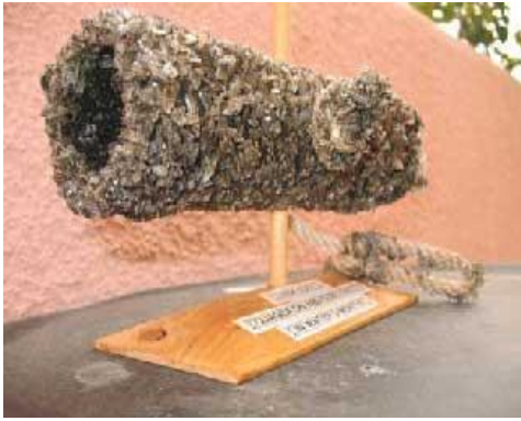
A Portland sampler that has been colonized by zebra mussels

Zebra and quagga mussels have devastated waterways and water systems throughout the United States and were recently found in Montana reservoirs. Once established, zebra and quagga mussels are impossible to completely eradicate. They also can reproduce and spread rapidly. One female zebra mussel can produce up to one million eggs per year. It is important to do everything you can to help prevent the spread of these invasive non-native mussels. As a volunteer in this program, we do not want to be part of the problem, so never travel from one lake to another without completely decontaminating your boat and equipment.