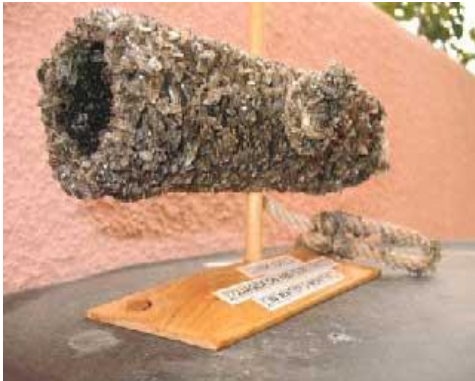
A Portland sampler that has been colonized by zebra mussels

Zebra and quagga mussels have devastated waterways and water systems throughout the United States and were recently found in Montana reservoirs. Once established, zebra and quagga mussels are impossible to completely eradicate. They also can reproduce and spread rapidly. One female zebra mussel can produce up to one million eggs per year. It is important to do everything you can to help prevent the spread of these invasive non-native mussels. As a volunteer in this program, we do not want to be part of the problem, so never travel from one lake to another without completely decontaminating your boat and equipment.