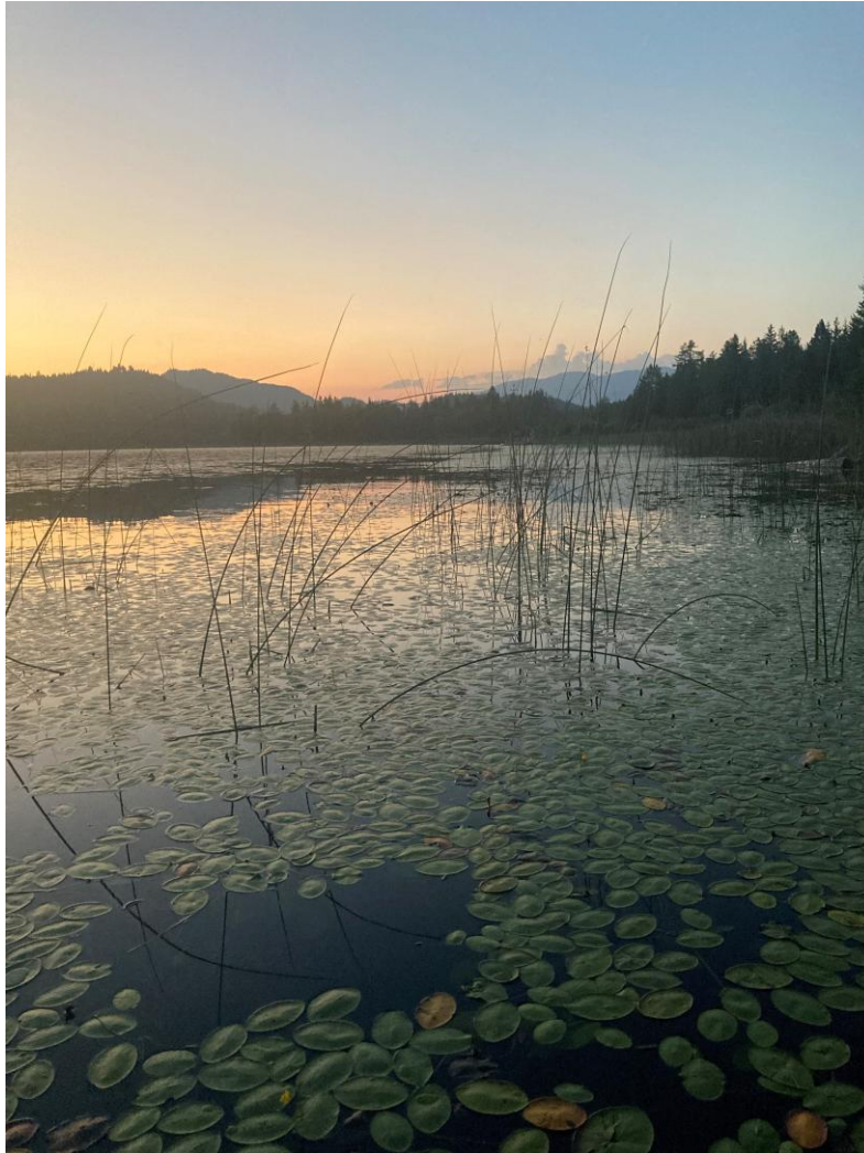
Blanchard Lake, Whitefish Montana